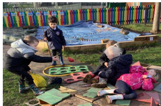
Make new friends and play new games