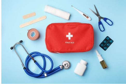
Learn basic First Aid

By the end of LKS2, children will have had the opportunity to: