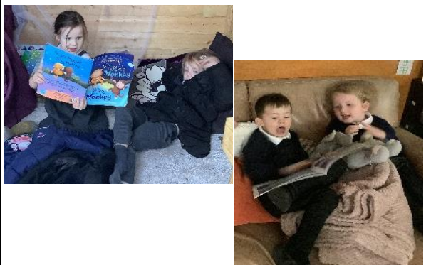
Listen to bedtime stories

By the end of Reception, children will have had the opportunity to: