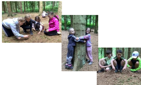
Go on a residential with friends