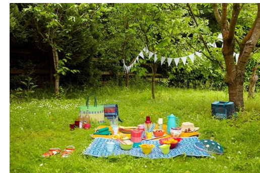
Have a picnic in the park