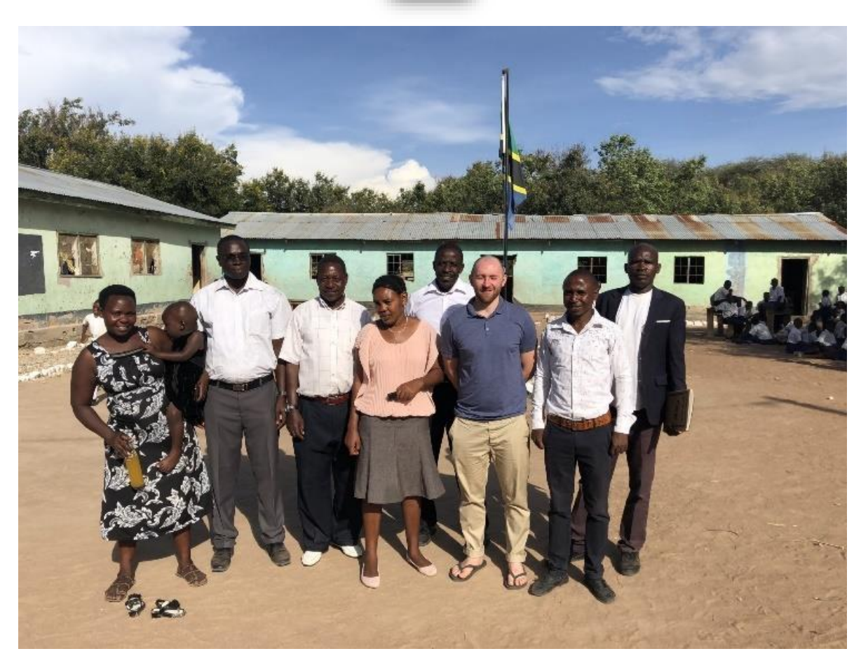
Ragata has 8 classrooms, 4 teacher houses, 8 toilet rooms (4 for boys and 4 for girls) and the nearest water source is 300m away from the school.