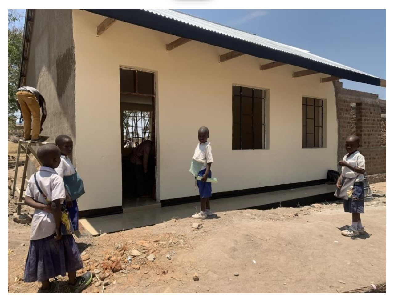
The children in Standard 7 completed their end of year exams (October 2022) and are now awaiting the results.